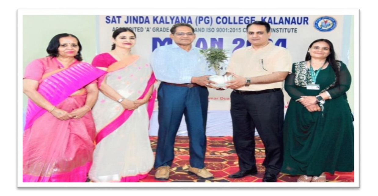
Organized Alumni Meet (Milan 2024) by Alumni cell on 20<sup>th</sup> April 2024